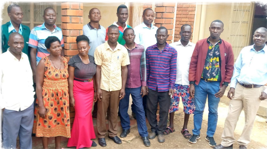
KVTC Faculty and Staff

DO YOU WANT TO GET INVOLVED “ON THE GROUND?” JOIN THE 2023 TEAM TRIP IN JUNE! (see below)