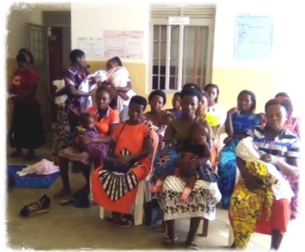
Good Samaritan Clinic

Then three years ago, prayers and initial plans were made to build essential student housing for the Kibbuse Vocational Training Center in Nyamarwa. The year before last, we committed to seeking funds for that project. During 2021, those funds came in, but construction was halted by an unexpected sad, and terrifying event.