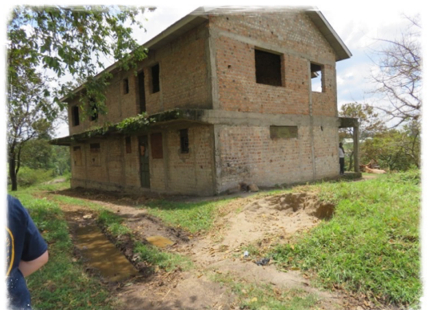
The “Hill House”