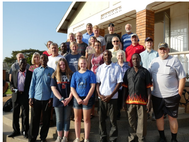
2020 mission team

One of the most meaningful parts of the trip will be worshipping at a local church. It is always a blessing to worship with our brothers and sisters in Uganda!